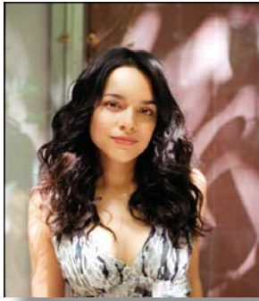
Norah Jones and Corinne Bailey Rae 8/24