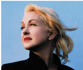
Cyndi Lauper 8/26

Gleefully ragtag new waver Cyndi Lauper was one of the biggest stars of the early MTV era, selling five million copies of her debut album, She's So Unusual , and scoring a string of Top Ten hits including "Girls Just Want to Have Fun" and "Time After Time." Don't miss her live in concert! www.chumashcasion.com